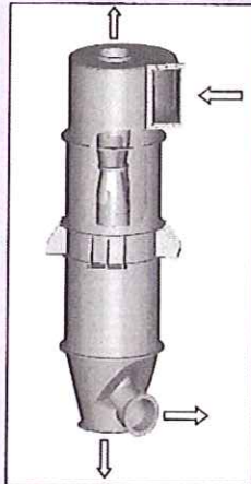
The principle of the HURRICLON with double dip tube and with two HURRIVANE installed

Today, with the breakthrough in HURRICLON technology, a new generation cyclone with combining high separation efficiency and low pressure drop is possible. Using HURRICLON, a breakthrough has been achieved by a combining this effect with the double submerged pipe principle. The rotational flow in the centre has been increased and this answers the demand for improved separation performance. A separation of up to 98 per cent is achievable with HURRICLON depending on application. The discovery of the HURRICLON submerged pipe control system has not only facilitated the achievement of the maximum economy, but has also reduced the energy consumption to a uniquely low level through the installation of the two units HURRIVANE between the double submerged pipe.